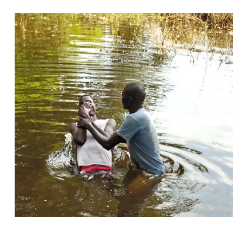
Baptisms Reported Often

The goal of $100,000 to be reached and matched by January 31st was a success, thanks to many. A total of $138,381.68 was given in 173 donations ranging from $20 to $22,200. This will go a long way in supporting the programs described below. A huge THANK YOU, to all who participated.